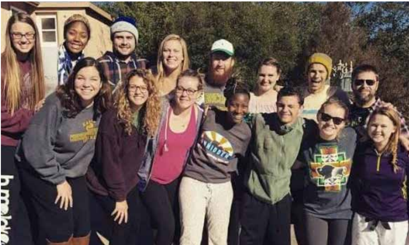
Concordia students attended the World Mandate West Missions Conference in San Diego